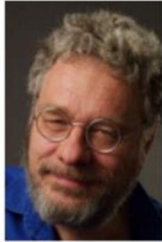
Webmaster/ Event Coordinator