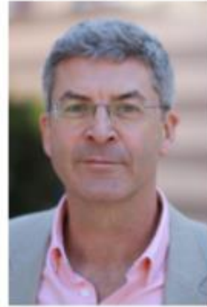
Responsible for Romandy